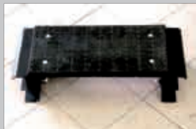
quick fit adapter