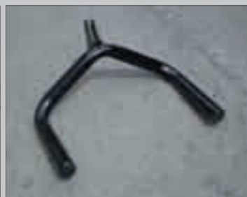
fork for tyres